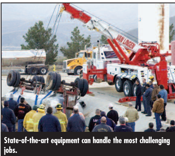
State-of-the-art equipment can handle the most challenging jobs.